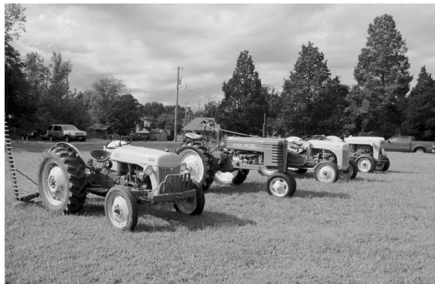
Some of the antique tractors on display at the "Old Tractor Show" next to the Drugstore Diner on Saturday, September 12.