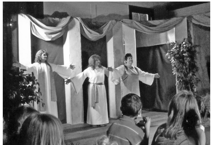
Angels appear in the Depot during the Living Nativity presented by the Baker's Creek and Pine Grove Presbyterian Churches.