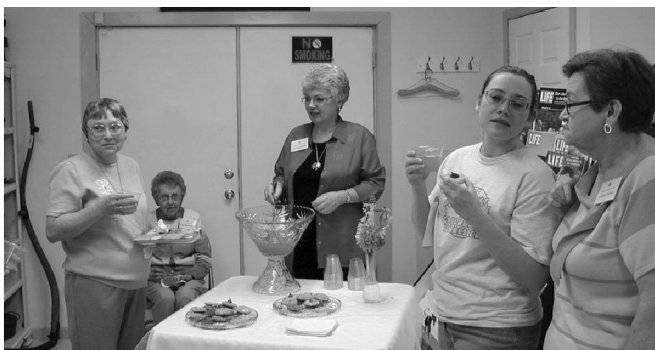
Visitors and staff enjoy refreshments at the Grand Opening of the Greenback Heritage Museum in 2006.