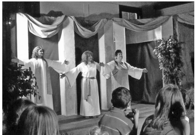
Angels appear in the Depot during the Living Nativity presented by the Baker's Creek and Pine Grove Presbyterian Churches.